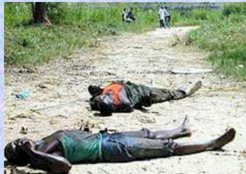
Exhibit 1 : Photos of massacre as reported by the news media